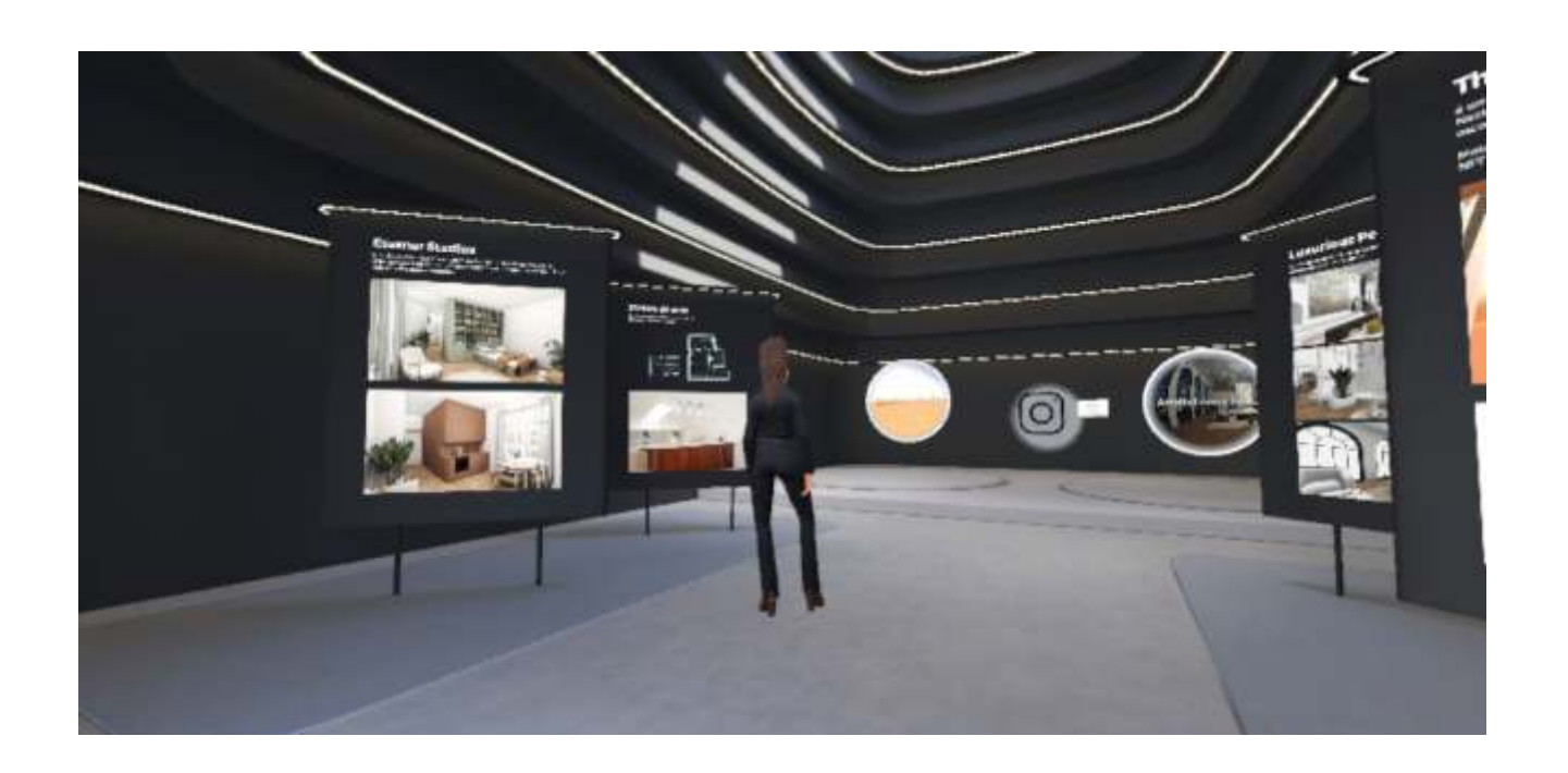
Ambits Arquitetura "A.03" | Branch A - First building on the left