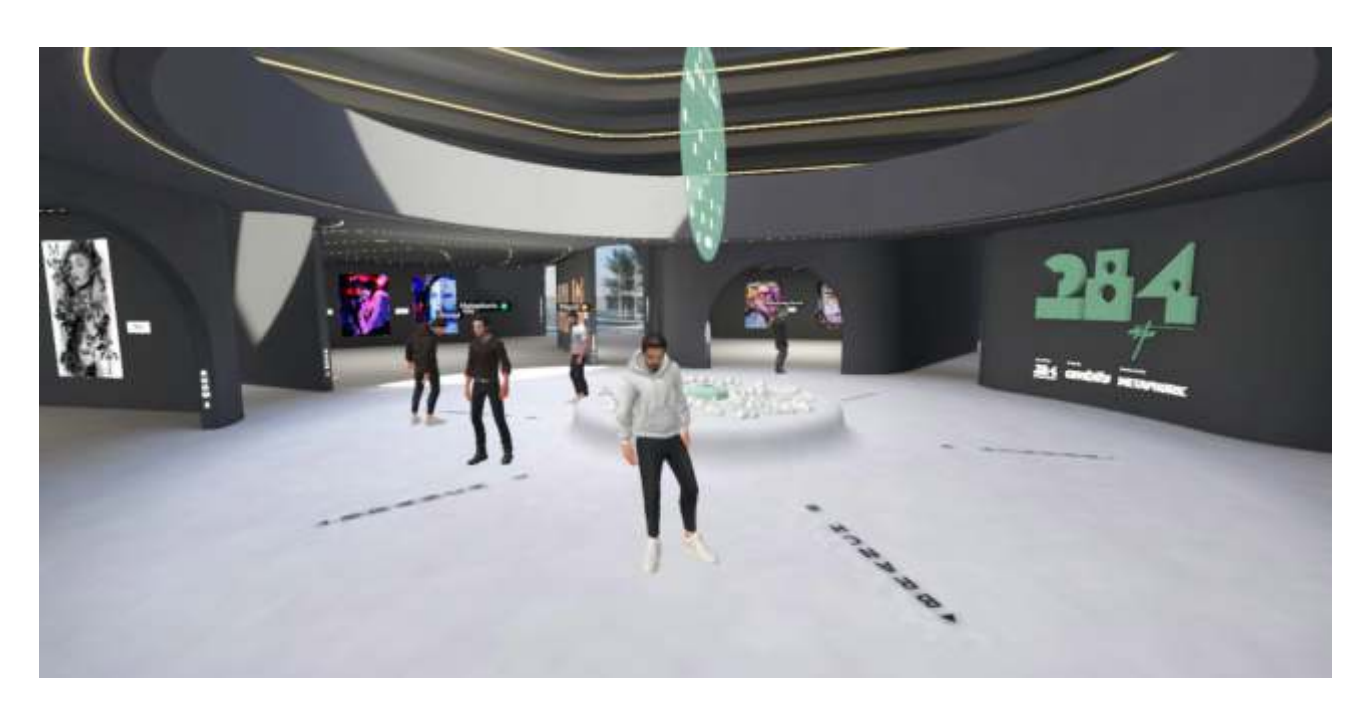
284 Meta Central Building

The physical exhibition, which is free of charge, is open to the public on Fridays, Saturdays, and Sundays, from 2:00 PM to 7:00 PM. In the metaverse, the exhibition remains free, and there are no longer any restrictions on time, location, or calendar. The visit can be made at any time, in any location in the world, for as long as the visitor desires and until they want to leave. The exhibition could remain on display forever.